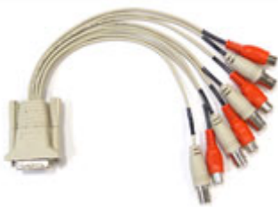
4 cam video cable