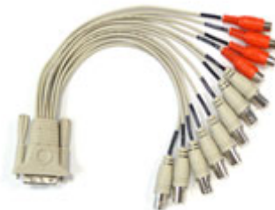
8 cam video cable